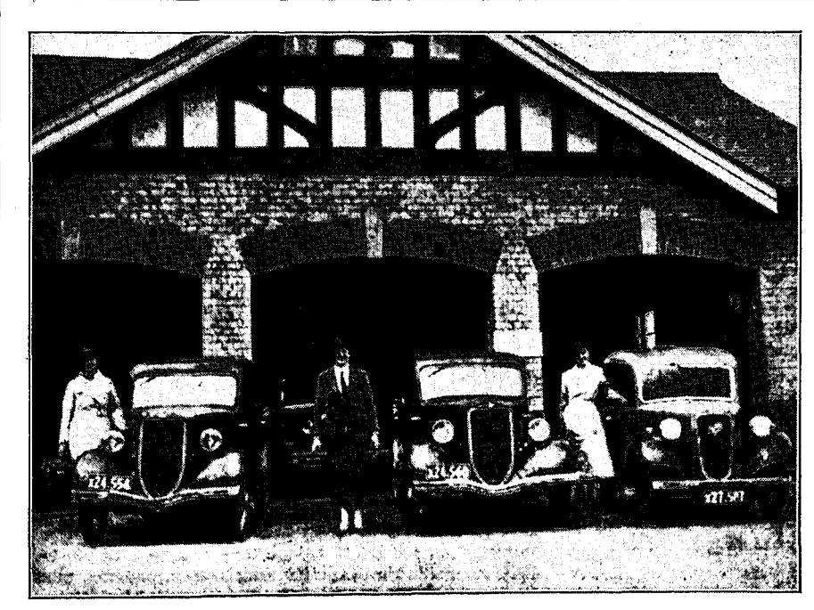
HOME NURSING SERVICES, AUCKLAND HOSPITAL, NEW ZEALAND.

place for a period of two years, and a separate variable annual grant towards the cost of insulin visits.